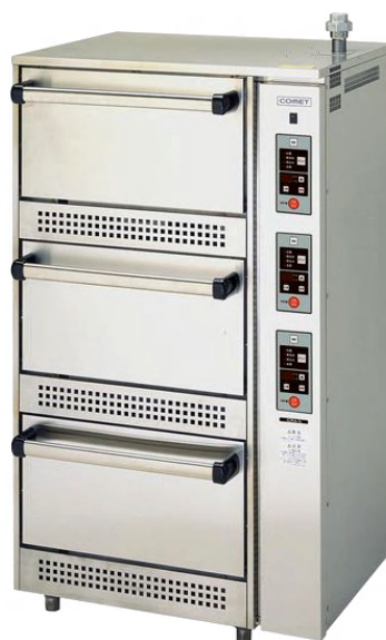
MODEL CRA-150N (Triple Deck)