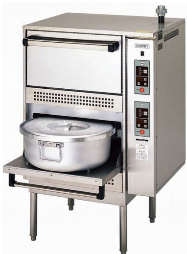
MODEL CRA-100N (Double Deck)