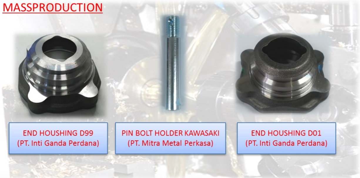
END HOUSHING D99 (PT. Inti Ganda Perdana)