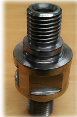
Conector Joint DC 350 T PT. Astra Honda Motor