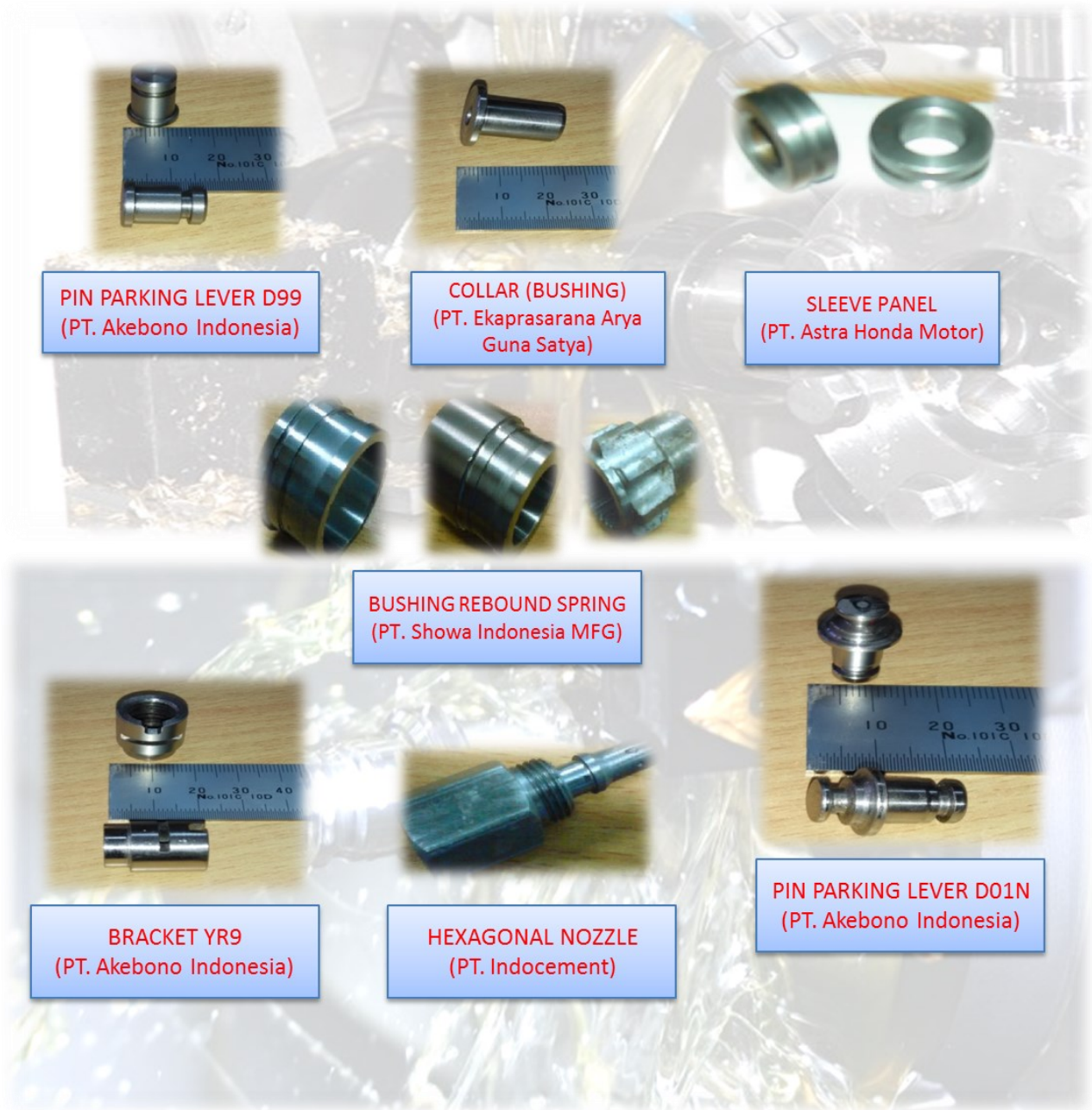
PIN PARKING LEVER D99 (PT. Akebono Indonesia)