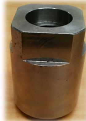
Plunger Tip DC 350 T PT. Astra Honda Motor