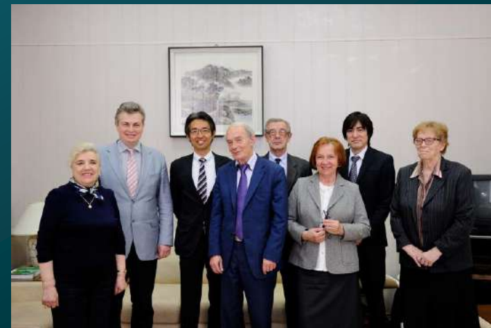
European scientists × NKG CEO