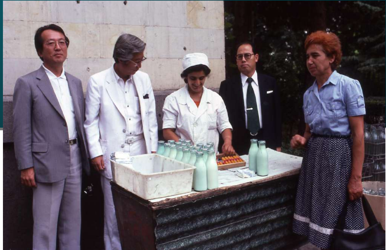
Founder's first business trip to the Caucasus region in 1977

In the 1970's, the Caucasus region was recognized as an area with the longest expected lifespan in the world. It is also noted that the Caucasus people have eaten "kefir" regularly for more than 2000 years . Our founder thought "kefir" can also contribute to helping Japanese people live a longer and happier life. Finally, we have decided developing and producing "Japanese kefir" by Japanese fermentation technology.